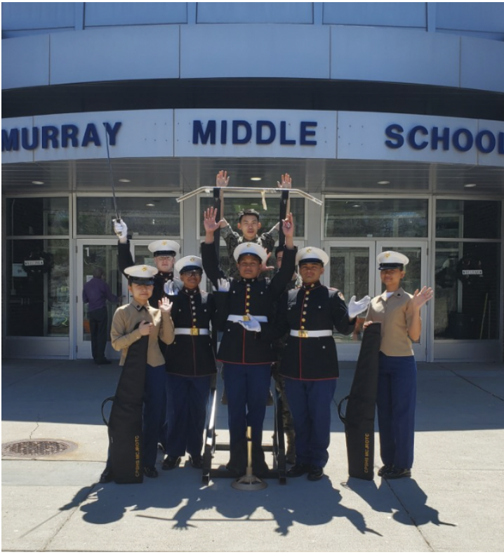
<u>Left</u>: The Como Park cougar color guard also performed at the Elbow Lake event. <u>Right</u>: Cadets work the 8th grade lunchroom at Murray Middle School to promote MCJROTC to next year's freshman. Great job!