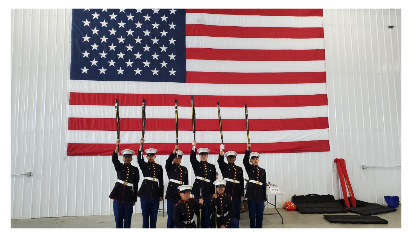
The Armed Exhibition team performed admirably several times for the town of Elbow Lake, Minnesota. It was an event at the local airport to honor the month of a military child. Thank you, Motivators!